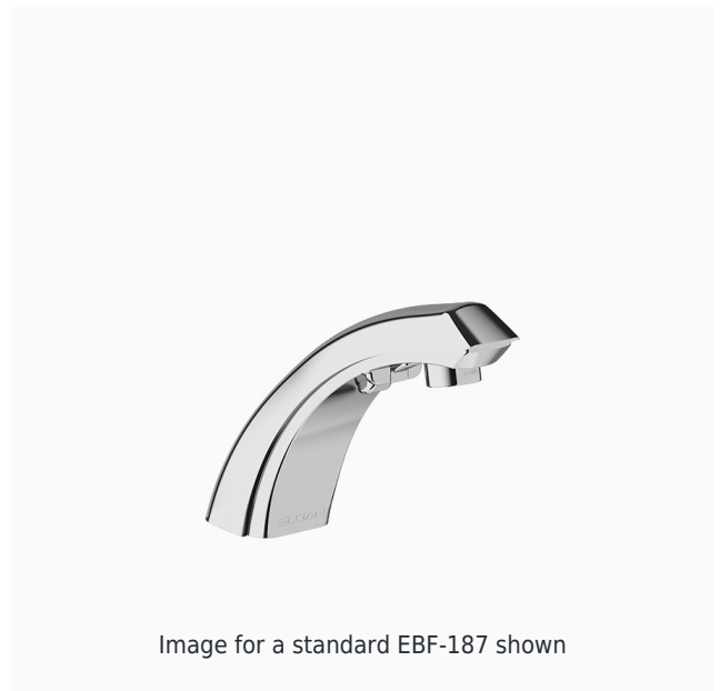
Image for a standard EBF-187 shown