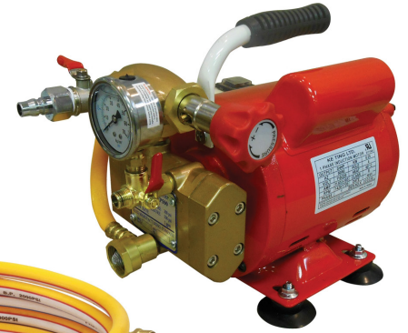
EHTP500 / EHTP500E