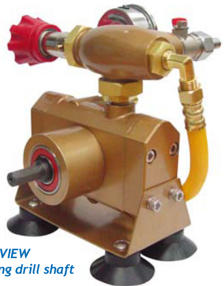
REAR VIEW showing drill shaft

*Inlet hose not included. GHT = Garden Hose Thread